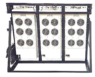
1:2 Redundant Version